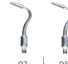
CAD / CAM